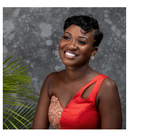
GHS464+ All Raw Images 10 Edited Images Special Set Up 1 Hour - 1.5 Hours