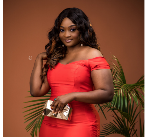
1 Hour Session